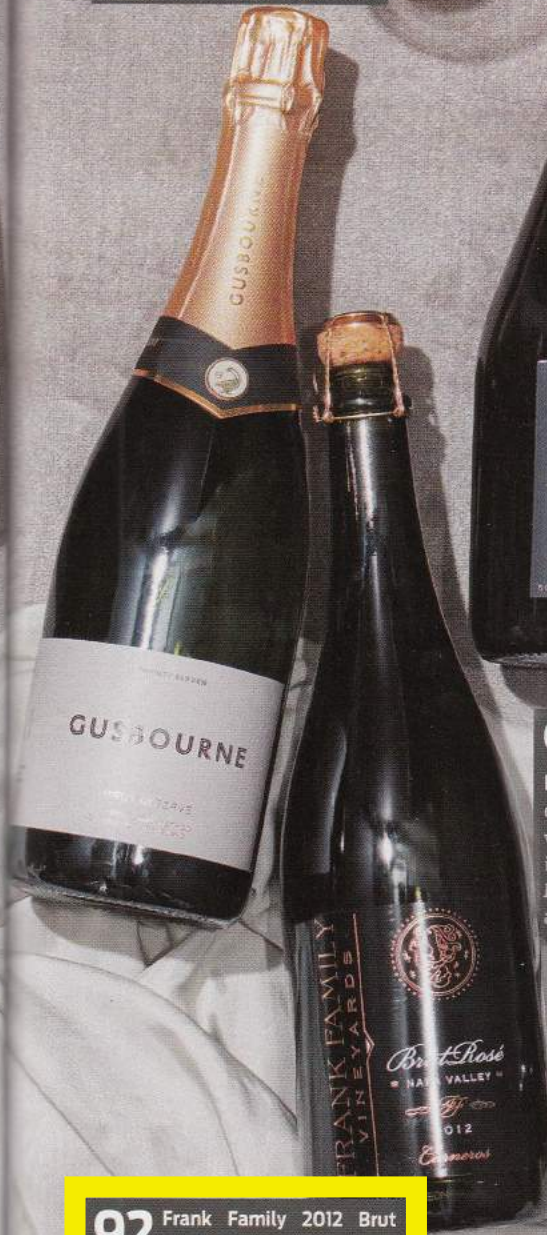
93 Gusbourne Estate 2011 Brut Reserve (England). A serious, well-brought-up wine, with a straight, upright back. Broadbent Selections, Inc. abv: 12% Price: $60