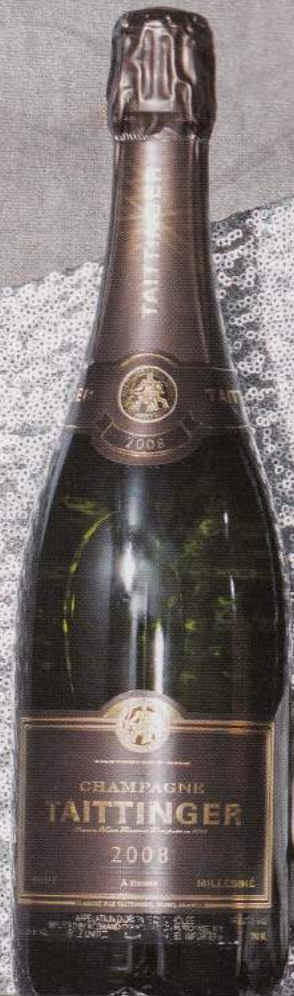
97 Taittinger 2008 Millésimé Brut (Champagne). Crisp and rich at the same time. Drink now or age until at least 2018. Kobrand. Cellar Selection. abv: 13% Price: $95

Here, we finally reach the domaine of Champagne and its equivalents from other parts of the world: Italy's Franciacorta, English fizz and upper-end efforts from California, Oregon and Tasmania. These are complex wines, capable of accompanying multiple dishes throughout a meal.