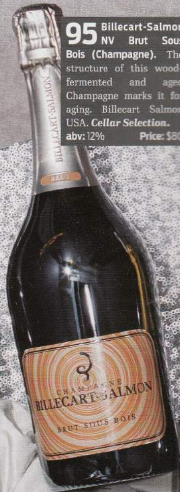
95 Billecart-Salmon NV Brut Sous Bois (Champagne). The structure of this wood-fermented and aged Champagne marks it for aging. Billecart Salmon USA. Cellar Selection. abv: 12% Price: $80