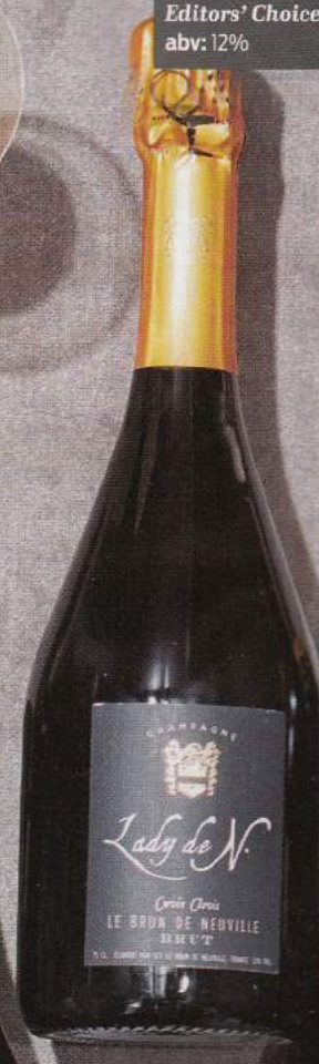
93 Le Brun de Neuville NV Lady de N. Cuvée Clovis (Champagne). Aged for seven years before disgorging to delicious maturity. Holiday Beverage. Editors' Choice. abv: 12% Price: $67