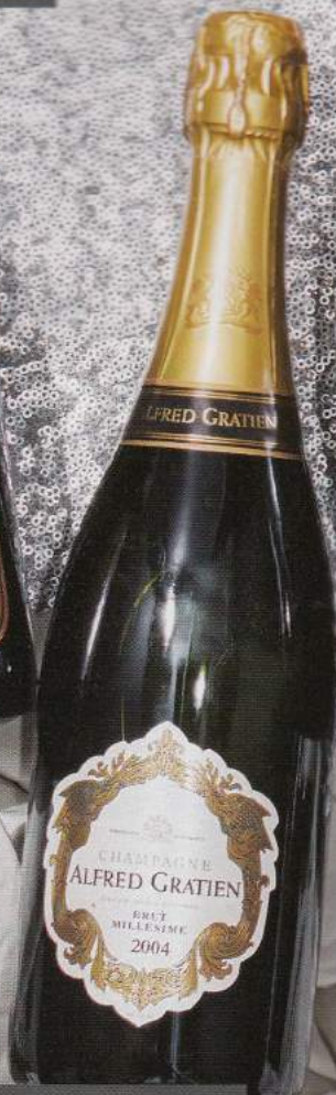
94 Alfred Gratien 2004 Brut Millésimé (Champagne). Textured, mineral-driven and full of nervous energy. Mionetto USA. Editors' Choice. abv: 12% Price: $90