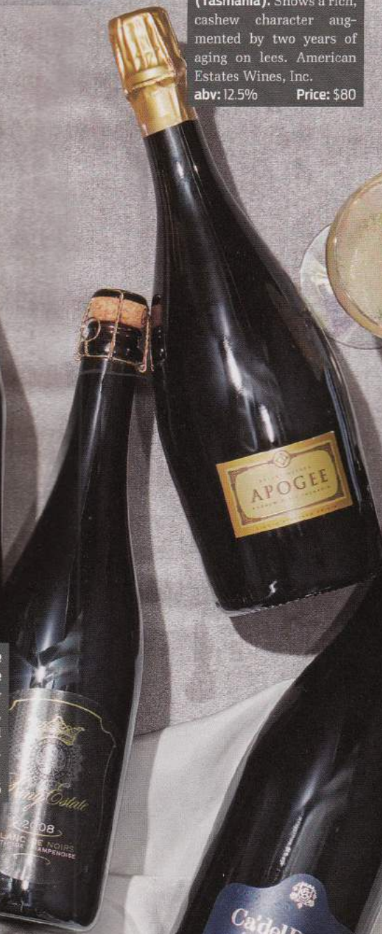
92 Apogee 2012 Deluxe Vintage Brut (Tasmania). Shows a rich, cashew character augmented by two years of aging on lees. American Estates Wines, Inc. abv: 12.5% Price: $80