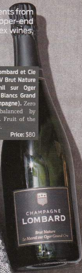
94 Lombard et Cie NV Brut Nature Les Mesnil sur Oger Blanc de Blancs Grand Cru (Champagne). Zero dosage, balanced by ripe fruit. Fruit of the Vines, Inc. abv: 13% Price: $80