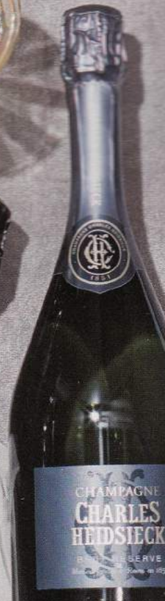
92 Charles Heidsieck NV Brut Réserve (Champagne). Deliciously balanced between ripe fruit and a crisp edge. Folio Fine Wine Partners. Editors' Choice. abv: 12% Price: $65