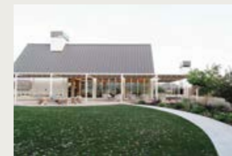
Fall at the Miller House