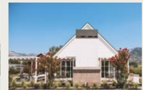
Summer at the Miller House

400 kilowatts, and will be installed on the roofs covering Frank Family's admin building, tank building, and barrel room. This means we won't just be purchasing clean energy and supporting the renewables market; we'll be generating it ourselves and adding more carbon-free power to the grid.