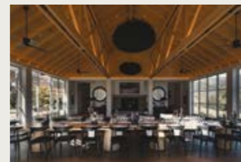
Interior panoramic of the Miller House