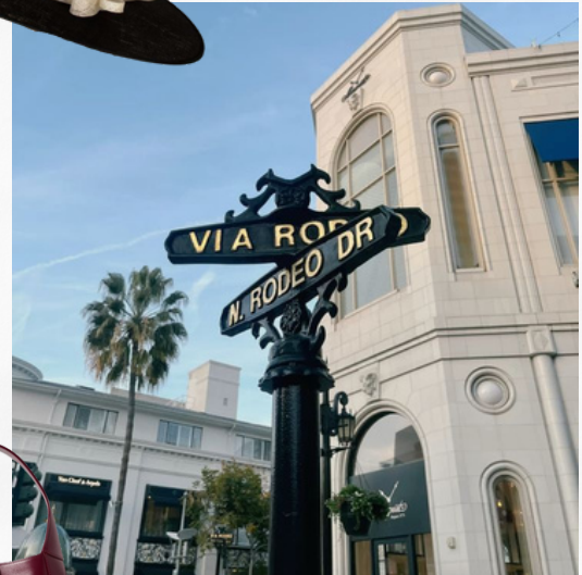
Bold City Glamour