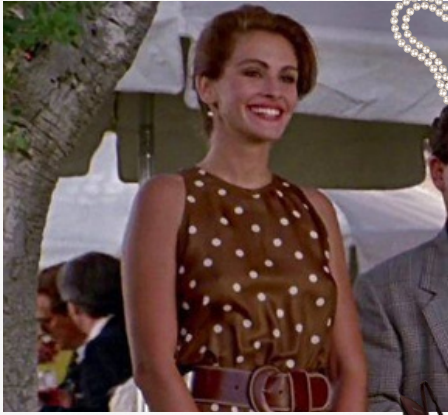
Elegant & Effortless

Inspired by the iconic style of Pretty Woman , this mood board blends Hollywood glamour with playful city-chic sophistication. Think bold red dresses, polka-dot prints, tailored blazers with shorts, and elegant white dresses accented with statement hats, silk scarves, and pearl details—perfect for strolling Rodeo Drive, sipping sparkling wine at a chic brunch, or indulging in a glamorous city morning. Flirty, glamorous, and effortlessly cinematic—just like Vivian herself.